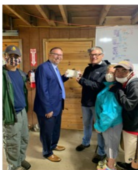
Peace Haven Farms