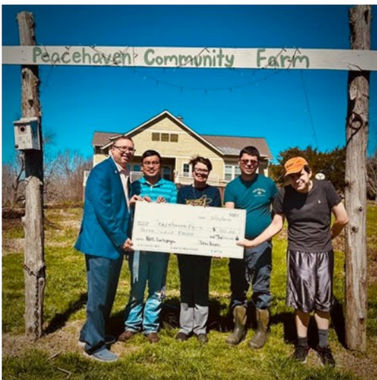
Peacehaven Community Farms