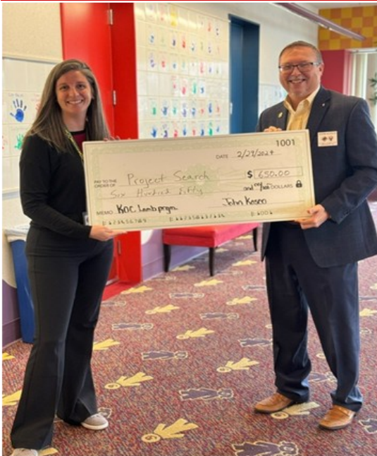
2023 Awards Presentation