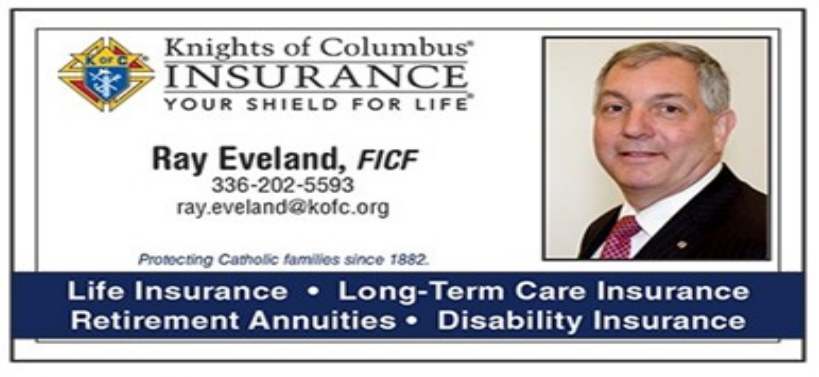
Facebook Page: https//www.facebook.com/EvelandKofC