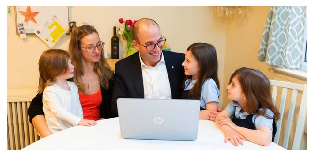
Family Peace of Mind