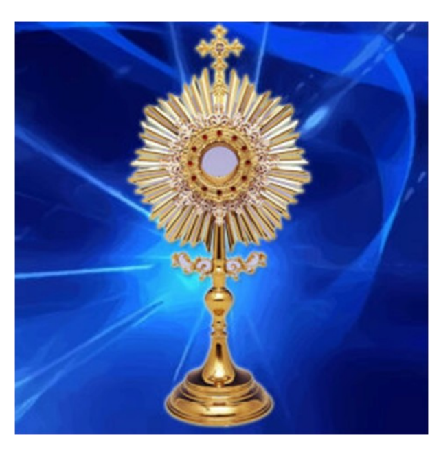
Come to me all you who ar labor and are burdened, and I will give you rest. Matthew 11:25

3:00 PM Chapelet of Divine Mercy 4:45 PM Benediction 5:15 PM Daily Mass