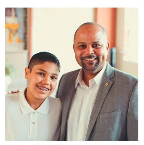
Meet your Agent