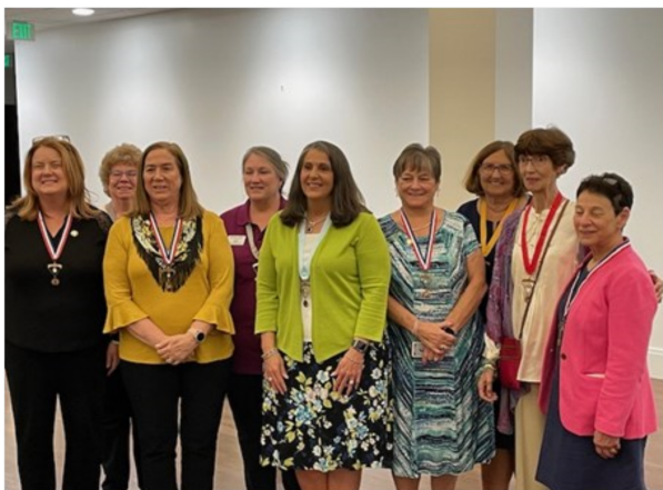
St. Pius X Columbiettes 2024-2025 Officers