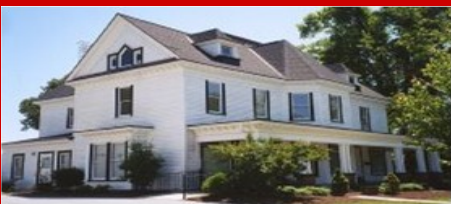
Room At The Inn